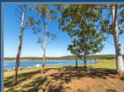
Bjelke Peterson Dam

Follow us on Instagram Discover South Burnett