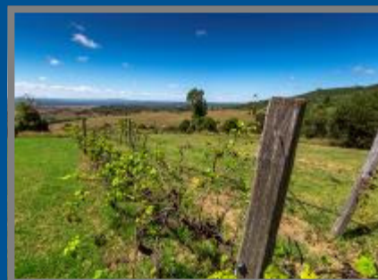
South Burnett Wineries