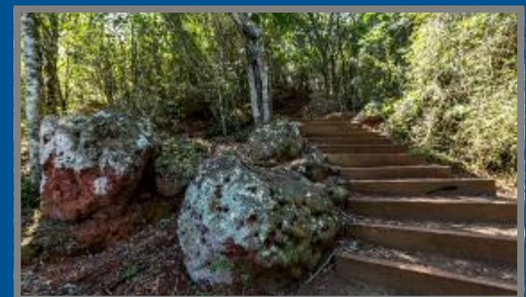
Boat Mountain - Murgon

Discover South Burnett www.discoversouthburnett.com.au f i