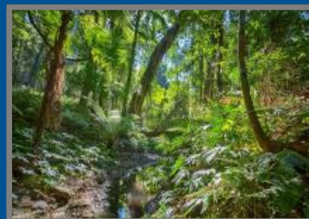
Bunya Mountains National Park